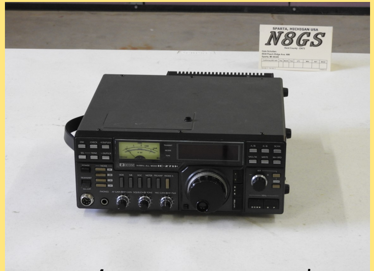
2 METER/ALL MODE IC271H—$375