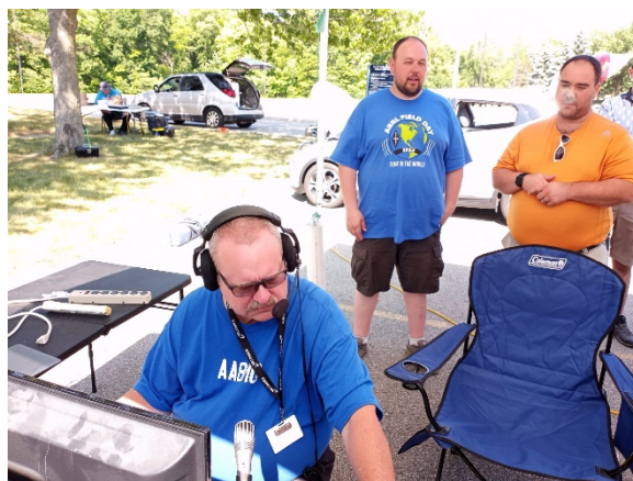
Here our GRARA Crew is operating

We also saw a number of our friends attending "DAYTON" 2023.