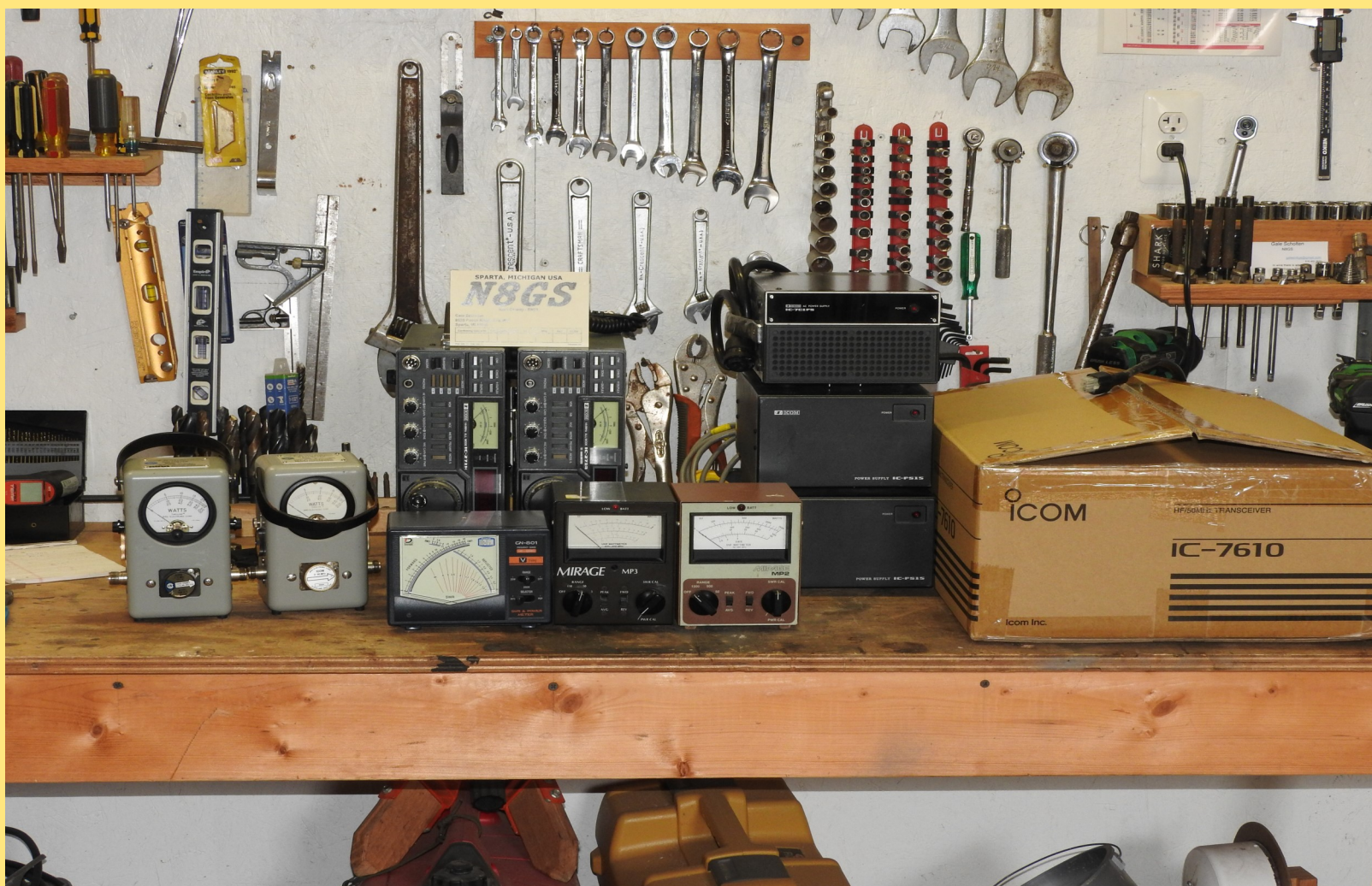
Bird 43, 3-30mhz, 1000w $525/Slug $180