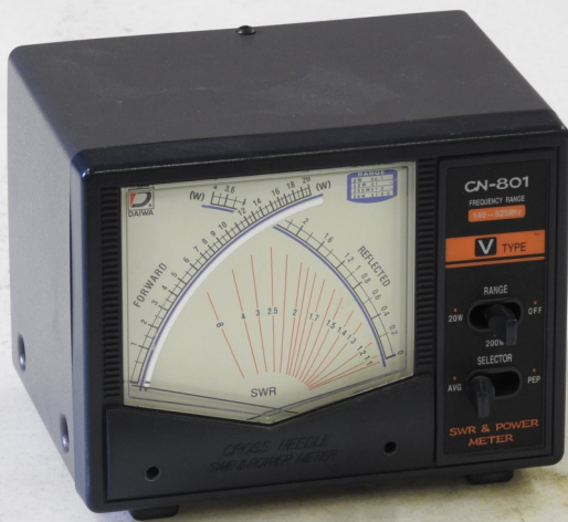
Diawa CN-801—HF SWR $155