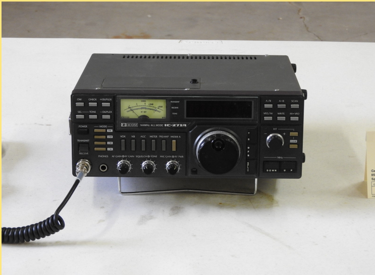
2 METER/ALL MODE IC271A—$275