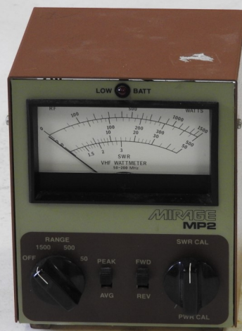
Mirage MP2 Wattmeter—HF—$50.00