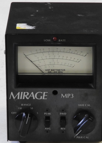
Mirage—MP3—UHF Wattmeter $ 85