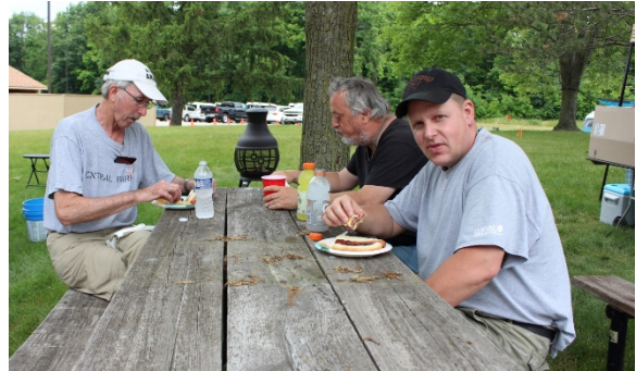
The gang sharing ideas. ( and food?)

Yummy. What's any kind of Ham event without the food!