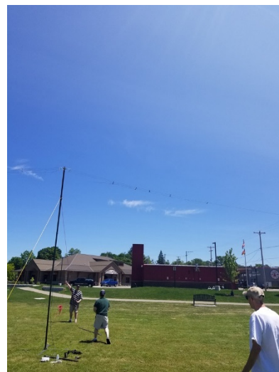
Above, Field Day 2019, setting up the dipole antennas.